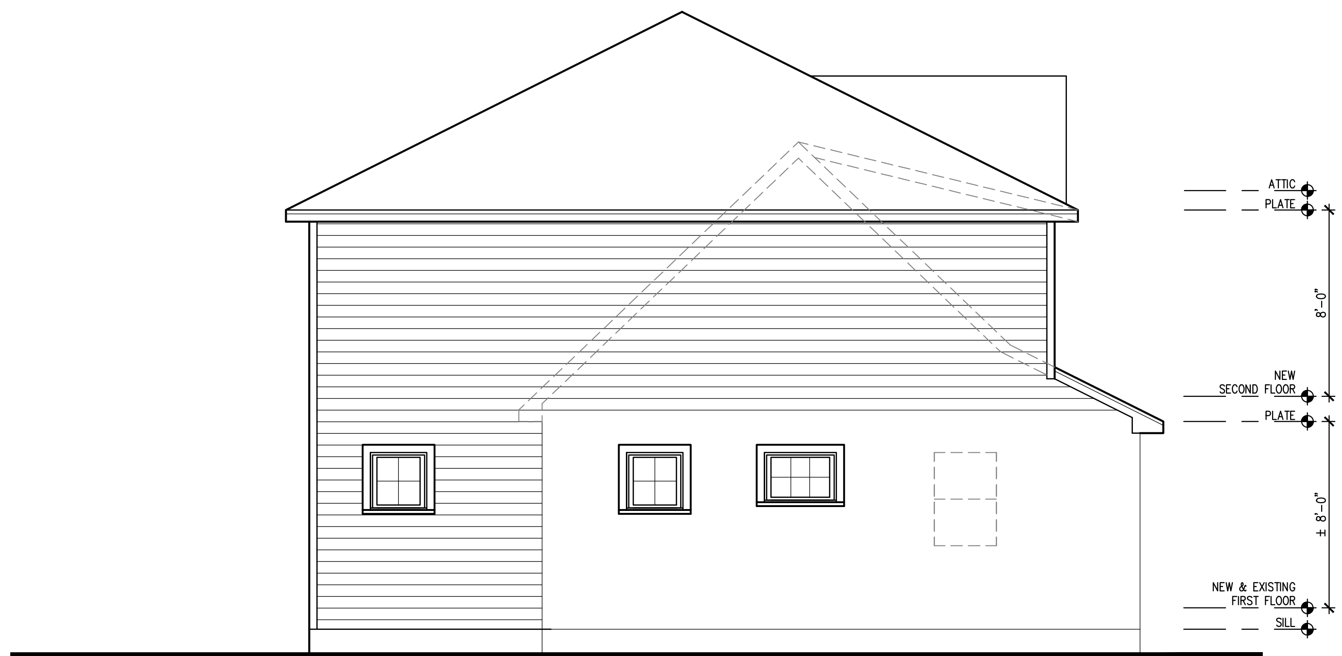
RIGHT SIDE ELEVATION SCALE: 1/4" = 1'-0"