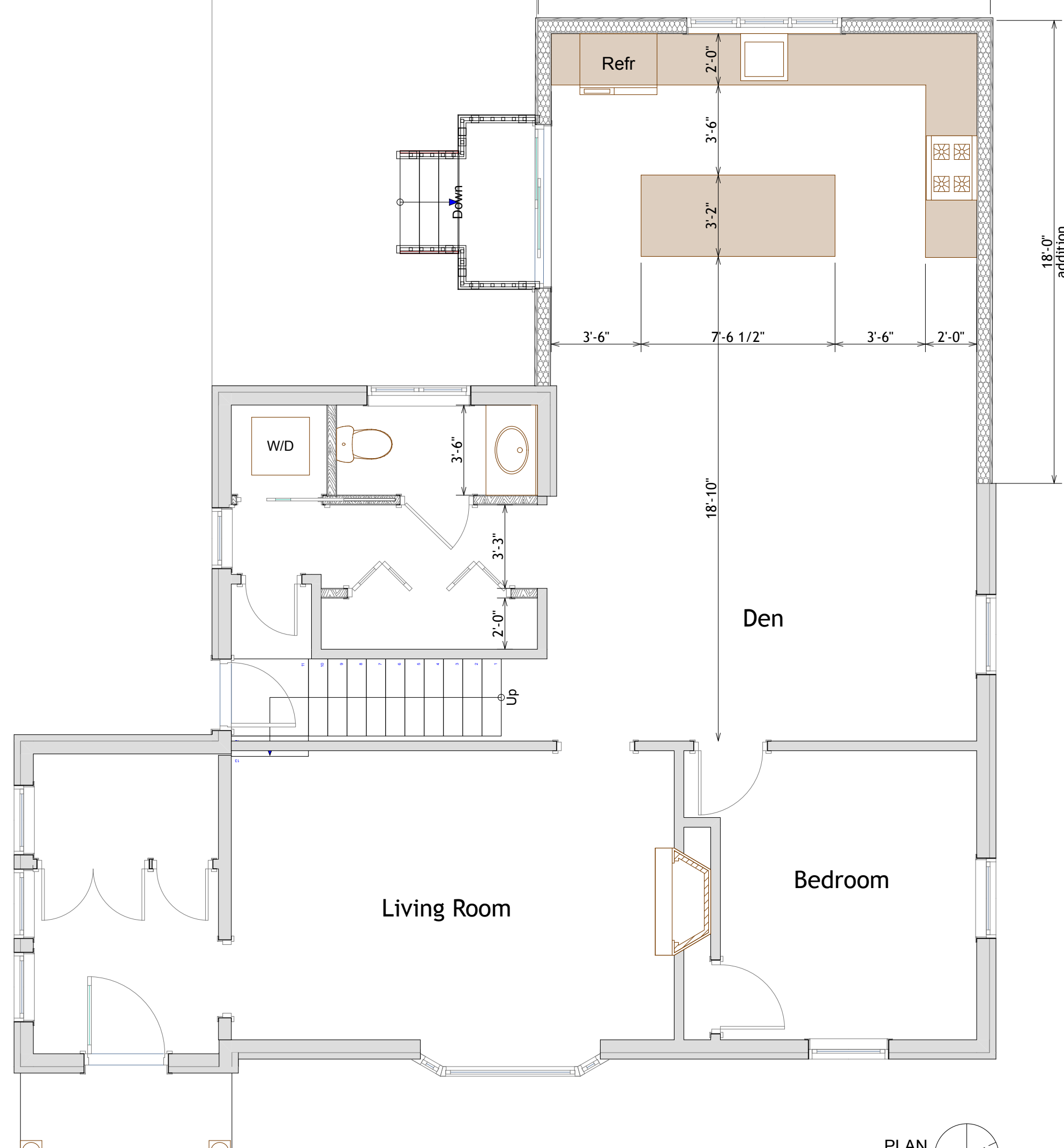
First Floor Plan SCALE: 1/4" = 1'-0"